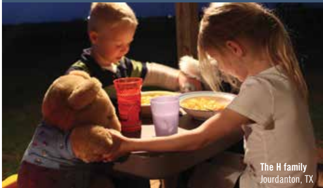
The H family Jourdanton, TX

“We’ve experienced the academic benefits of using Sonlight. We’ve also had the delight of watching this curriculum impact our children’s character. Little did we know that the seeds planted by Sonlight’s inspirational biographies and stories of diverse cultures would sprout up children who long to allow God to use their lives for His glory.”