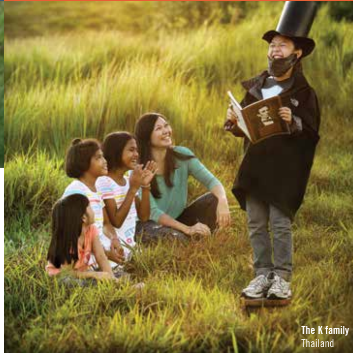
The K family Thailand