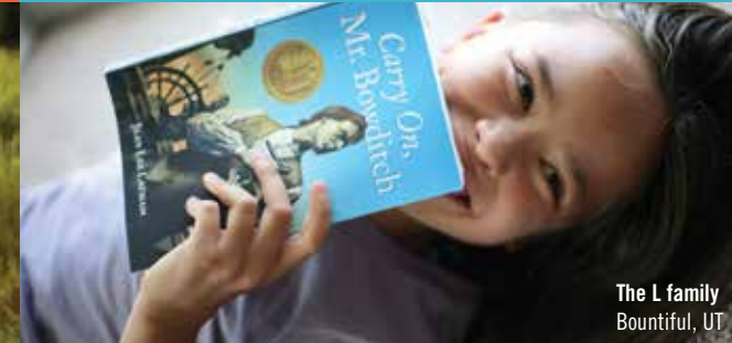
The L family Bountiful, UT