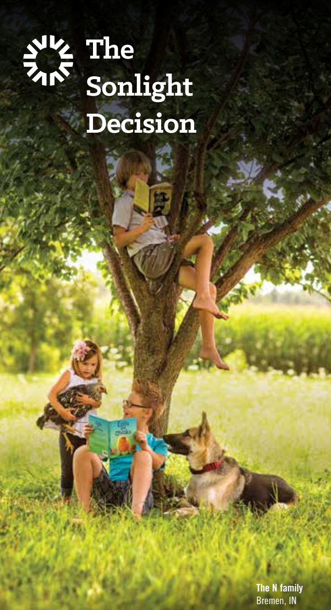
The N family Bremen, IN

“We love Sonlight’s style because it teaches our children HOW and not WHAT to think. They’re learning to read, research and evaluate. It’s all ready to go and simple to use. I’ve never regretted this decision!”