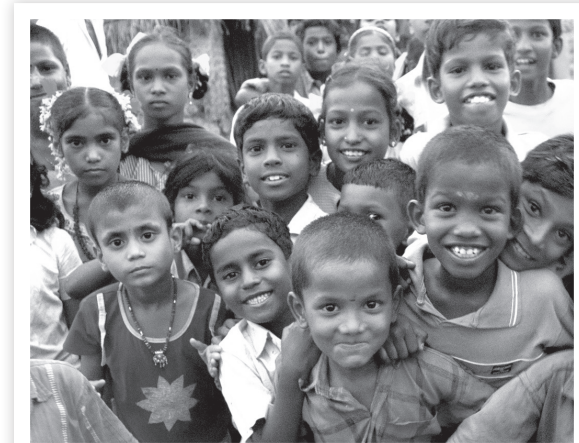
India's kids are God's most effective evangelists. Your children can introduce them to Jesus, and make an incredible impact on the Kingdom!

In addition to the videos, which Mission India will post each Tuesday and Thursday morning beginning October 5 and ending November 9, you will also find photo slideshows, family devotionals and some creative learning experiences for your family. And, of course, we've created a special "My Passport to India" forum at www.sonlight-forums.com/MyPassportToIndia .