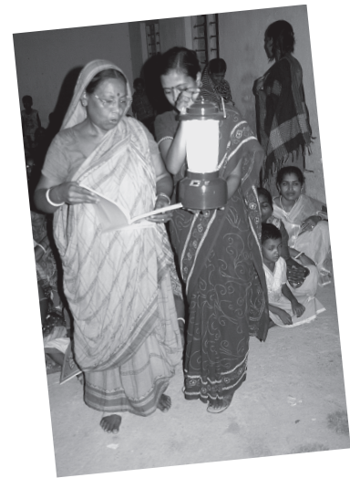
One of half a dozen women who demonstrated their prowess, the woman on the left is reading a selection from her reader. The room, jammed with over 100 women and children, was lit by nothing more than two lanterns—one of which the woman on the right is holding.